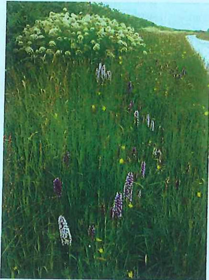
Orchids at Round Ash Moor