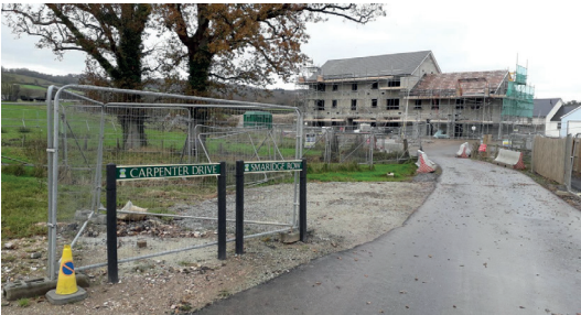
Streets on the Challabrook development named after two of Bovey's 2nd World War casualties

Bovey Tracey Town Council has recently named the streets in two large developments after individuals commemorated on the town's 1st and 2nd World War war memorials, respectively, and is now looking to set up a small advisory group to suggest future street names.